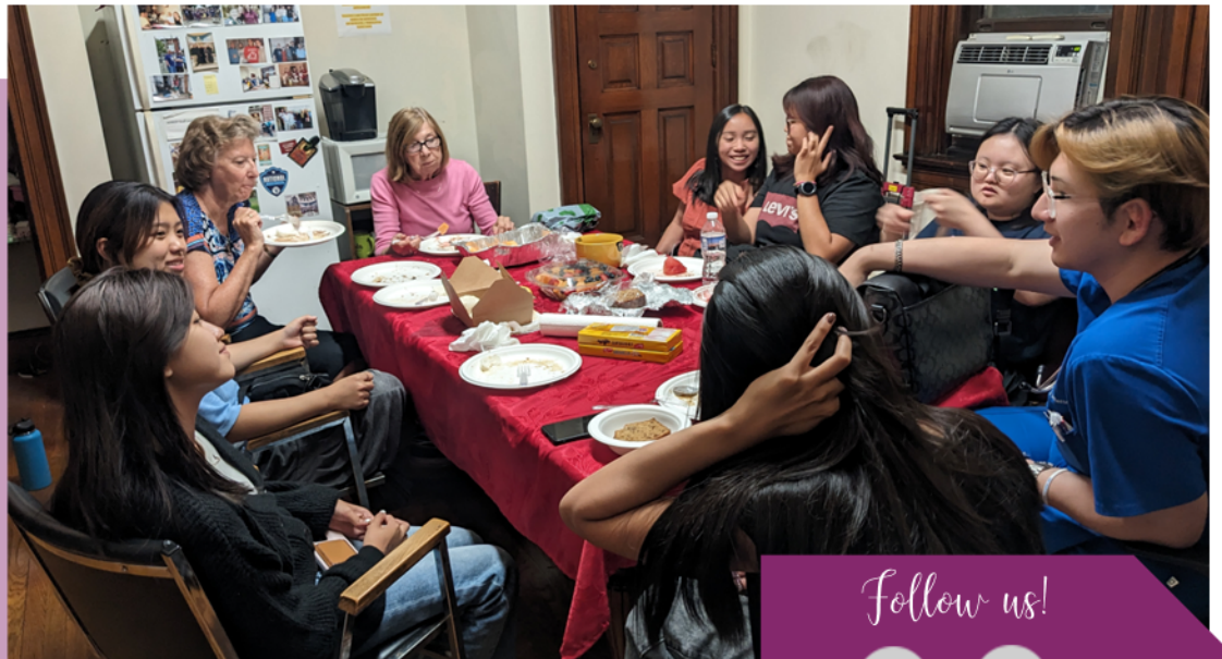
SOME OF THE CLINIC STAFF RELAX AFTER A BUSY NIGHT SEEING PATIENTS.

In your busy lives, seek, no demand, quiet. Therein you will find your purpose and you will resolve to be true to the real you. Imperfections acknowledged, fears confronted, you will come forth from the quiet refreshed and ready to be of service to those who lovingly call your name.